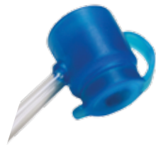
LOCTITE® 3922™ bonds thermoplastic inlet valve assembly.

Benefits of this light source are that it is inexpensive, small in size, portable, and generates minimal heat and minimal ultraviolet energy, making it safer to work with than traditional UV light sources.