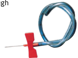
LOCTITE® 4011™ replaced solvent bonding in this PVC tube to copolymer fistula assembly.

LOCTITE® 4011™, a surface-insensitive cyanoacrylate, was specified. It filled the gap and had enough strength to pass the burst and pull tests with ease. Since the manufacturer already used LOCTITE® 4011™ in another area of the plant, making the switch was easy. Production goals were met, inventory was used, product quality was assured and a potentially troublesome toxic solvent was eliminated.