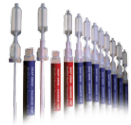
LOCTITE® 3311™ offers adhesion to various swab substrates, resulting in a safer and more reliable device.

The new product was designated the SnapSwab™ and consisted of a Dacron® swab tip on a polystyrene shaft encased in a polyethylene tube. It was necessary to reliably attach the swab to the inside of the tube and ensure the entire assembly be leakproof. LOCTITE® 3311™, a single-component light cure acrylic adhesive, was the adhesive of choice for the new swab device. Rapid, semi-automated processing, and high adhesion to the various swab substrates resulted in a device that was safe, convenient, dependable and inexpensive.